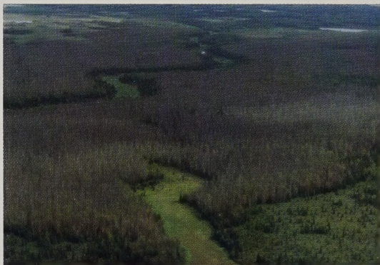
Figure 1. Defoliated aspen trees near Willow, Alaska.

When trees are not healthy and vigorous when attacked, the chance of death increases after